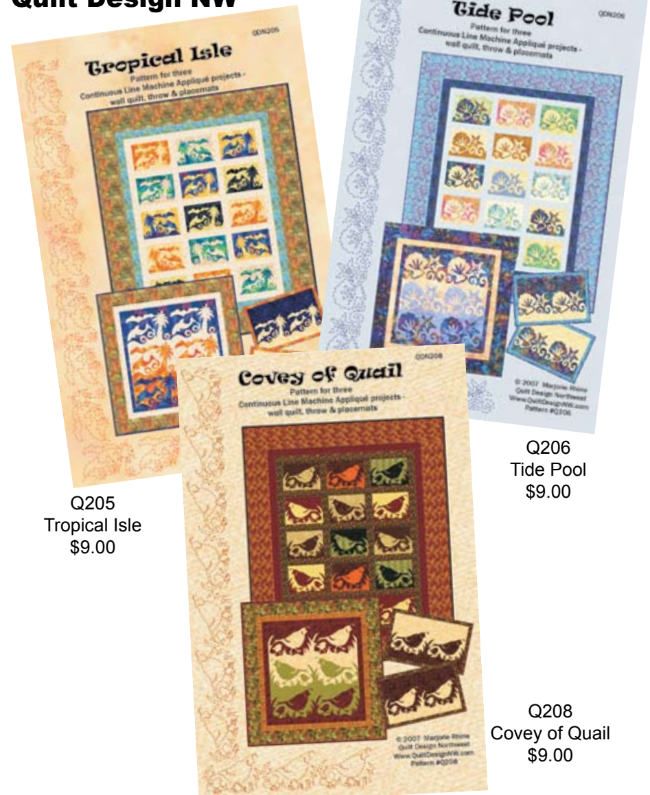
Q205 Tropical Isle $9.00